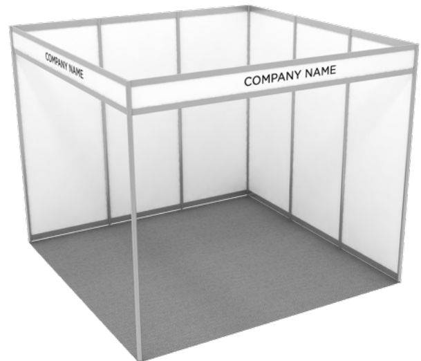
3m x 3m CORNER BOOTH